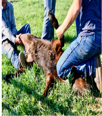
Roping and wrestling

Common methods used in western Canada for handling and restraining beef calves during processing: