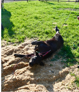
Roping and Nord fork