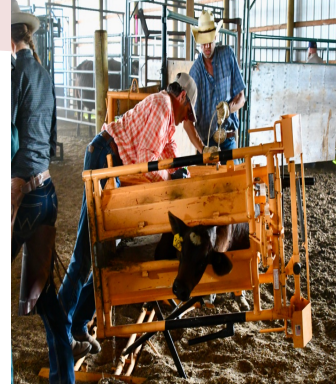
Use of tilt table

OUR OBJECTIVE Comparing effects of common methods of handling and restraint used during processing on calf behaviour