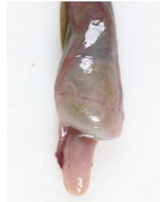
Ceca containing H. gallinarum worms

Heterakis gallinarum were found in the ceca of 48-week-old broiler breeders submitted for necropsy exam. The incidence of cecal worms in broiler breeders is increasing in North America. H. gallinarum eggs carry the protozoa, Histomonas meleagridis , the causative agent of black head in turkeys. Black head can cause up to 100% mortality in a turkey flocks making control of H. gallinarum in chickens important to minimize the