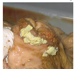
Article and photo courtesy of Sara Skotarek Loch

approaches for parasite control are not sustainable. Effective parasite control now involves more than just alternating products, but also using different classes of dewormers for effectiveness to mitigate further resistance issues. Ideally, better grazing management combined with targeted treatment strategies are implemented together. This rise in resistant parasites means that veterinarians play a crucial role in educating producers and owners about diagnosis and targeted treatment of their animals.