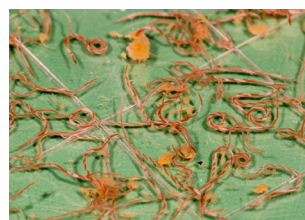
Haemonchus contortus worms (PC: Paul Gajda)

It is important to monitor ewe fecal egg counts in the spring to assess likely pasture contamination and parasitic disease risk later in the season. Haemonchus contortus , a common cause of anaemia and even mortality, is generally resistant to ivermectin and fenbendazole/albendazole drugs in western Canada and so is not well controlled by these products. Closantel, the only effective drug currently available in Canada, should be judiciously used using risk assessment and targeted selective treatment principals. For further information see https://vet.ucalgary.ca/research/sheep-parasite-control/home . Courtesy of Dr. John Gilleard