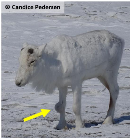
Brucella bevaqtuq: tukturni hauninun puvitpaqtut