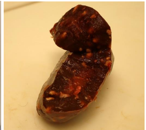
Brucella bevaqtuq; anniarutiniqtuq umingmaq taqtuminni. Tuqtu. Kiqarun avvikglugu. Ahiin taquniatahi qaqtanuat quyiktut- qaqtat puvinnit (tahopqaamiraitunik Brucellamik)